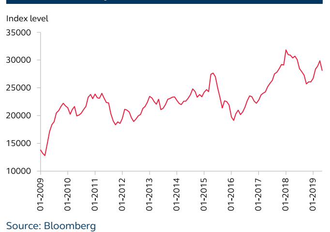
Figure 2: Average Daily Volume of HSI Futures and Options*